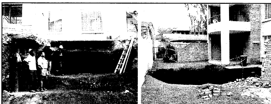
Figure 2 Recent 'medium' sinkhole in a high-density residential development

(2000), however, requires that damage in areas underlain by dolomites should not be more severe than that associated with category 4. This level of expected damage is consistent with the aforementioned safety requirement that there must be sufficient time for occupants to escape from the structure after the occurrence of a sinkhole.